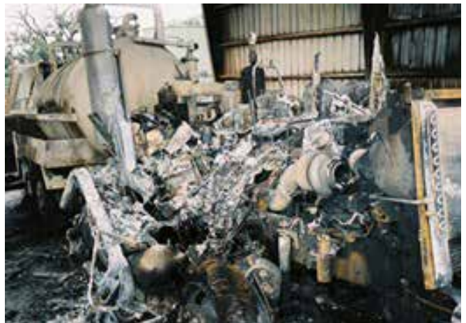
One of two trucks destroyed in a fatal accident in Texas (2003) due to engine runaway.

The 'lessons learned' of accident investigation have helped introduce a progression of both private company and national sales policies that require the preventative measure of an 'automatic air intake shut down valve' to be fitted to vehicles and equipment working in these refinery, gas plant and fuel storage or processing areas. Stopping the engine this way naturally eliminates potential flames and sparks being emitted before the leaking gas concentration rises into the flammable range.